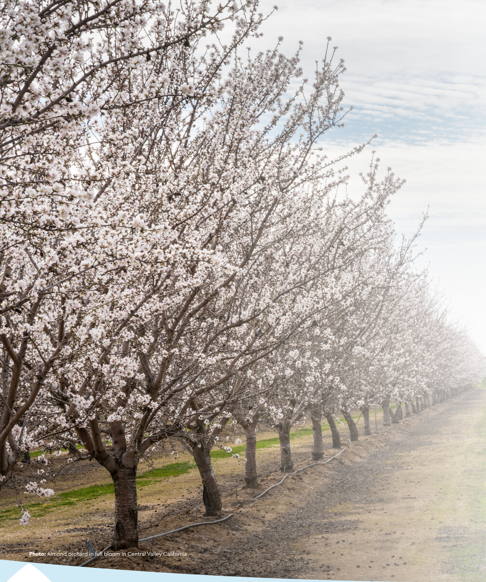
Photo: Almond orchard in full bloom in Central Valley California