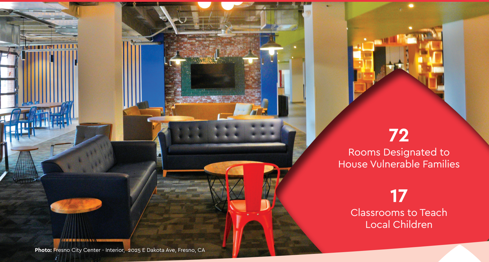
Photo: Fresno City Center - Interior, 2025 E Dakota Ave, Fresno, CA