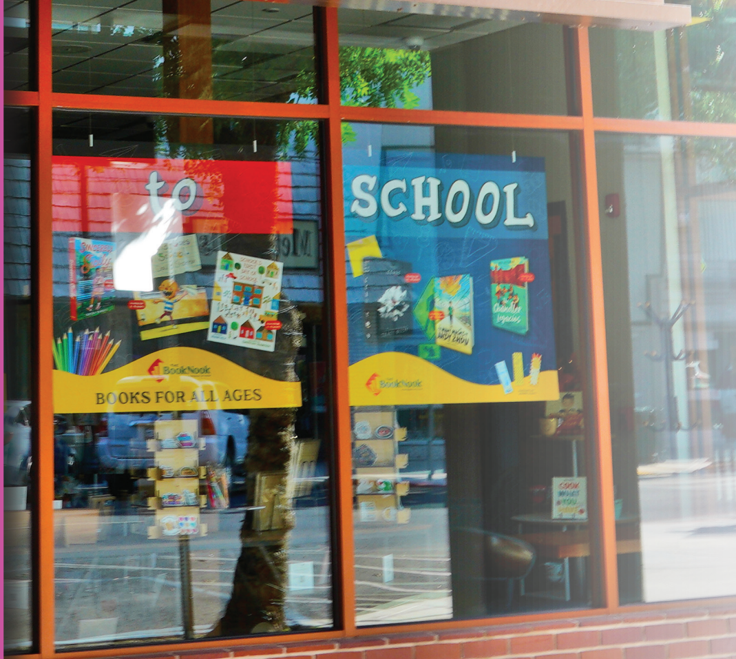
Photo: The Book Nook, 114 W. Main St. Suite 102, Visalia, CA