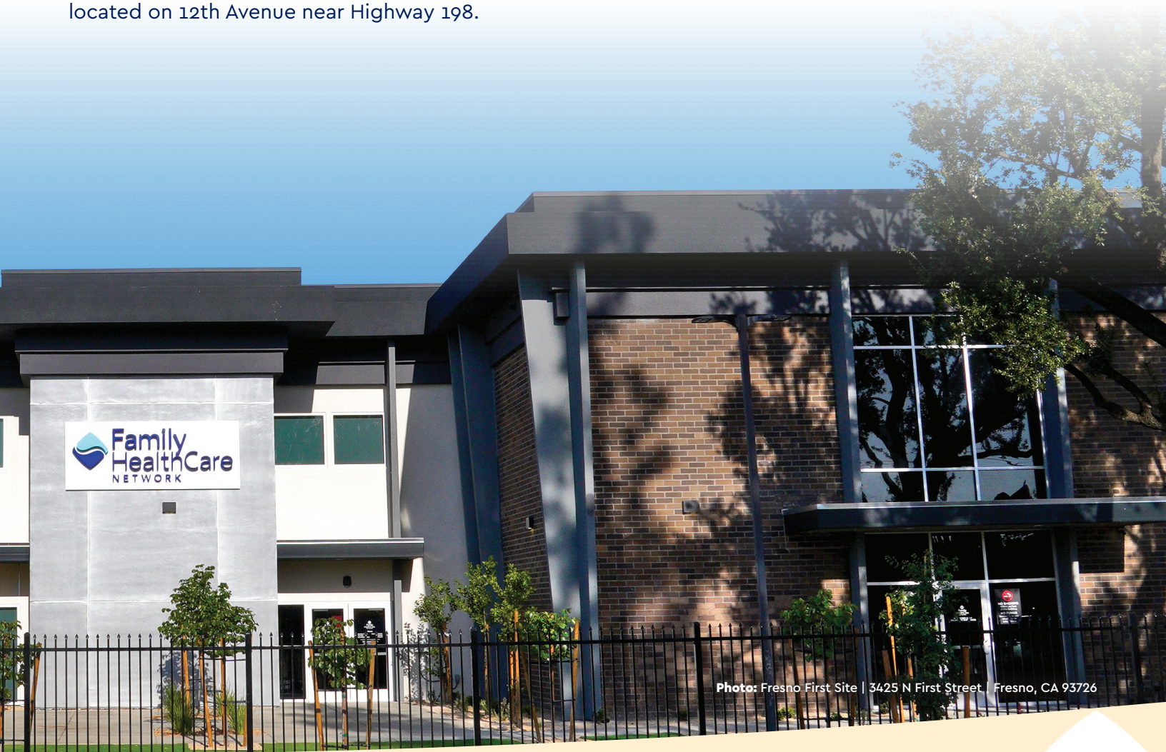
3425 N First Street | Fresno, CA 93726

Springville – Plans have been approved for a new Springville health center, which will offer both medical and dental services. We anticipate this new location will open in 2024.